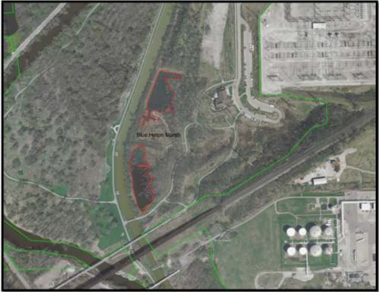
Map 2. Blue Heron Marsh in Ohio & Erie Canal Reservation