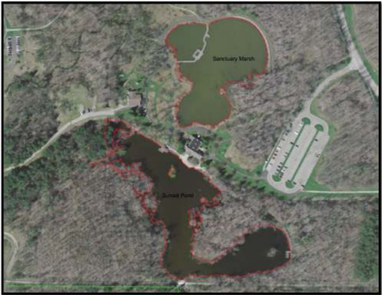
Map 1. Sunset Pond and Sanctuary Marsh in North Chagrin Reservation