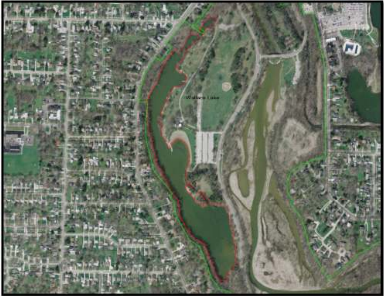
Map 5. Wallace Lake in Mill Stream Run Reservation