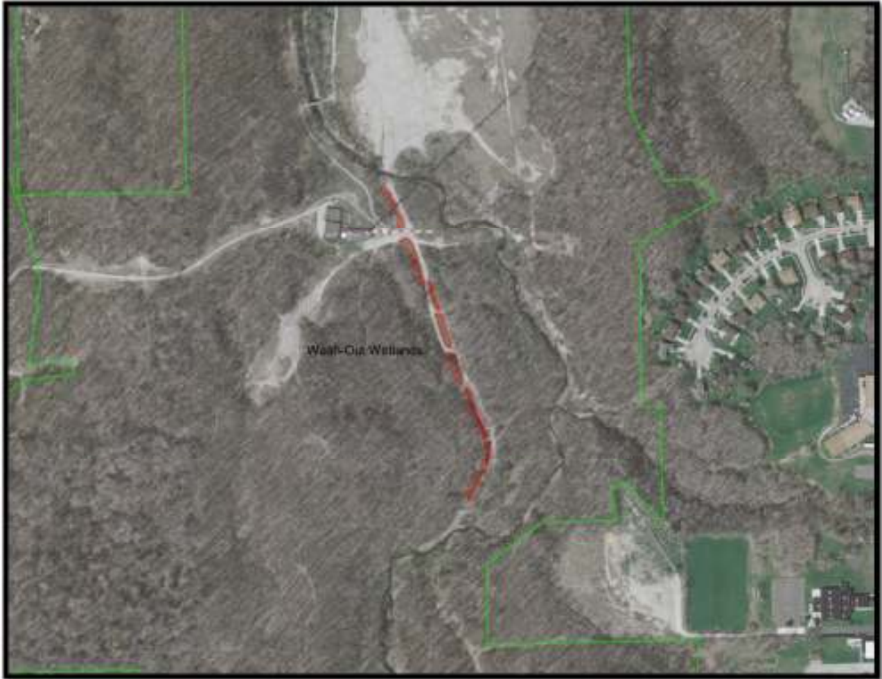
Map 4. Wash-Out Wetlands in West Creek Reservation