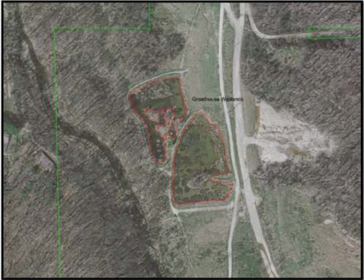
Map 3. Greathouse Wetlands in West Creek Reservation